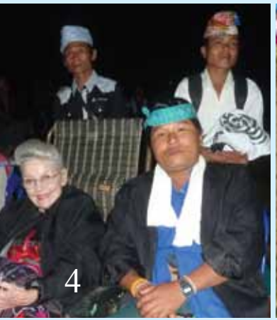
4. The Laytongku head man front right enjoys the program