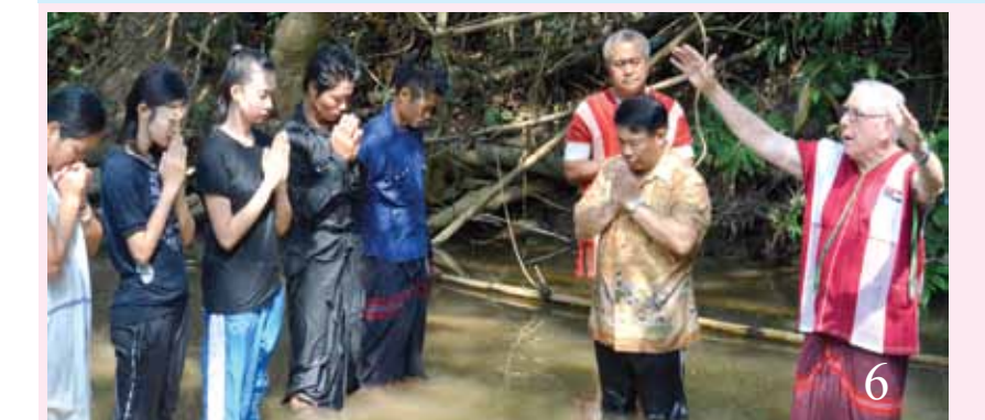
6. Five were baptized in the stream, including two CCI's performers.