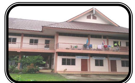
Lawa (Wa) Hostel