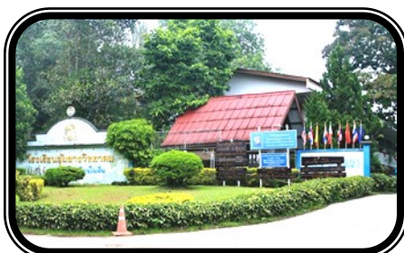
Umphang Witthayakhom High School