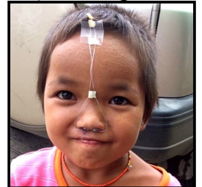
3) After surgery