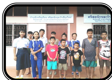
Lawa (Wa) Hostel Students