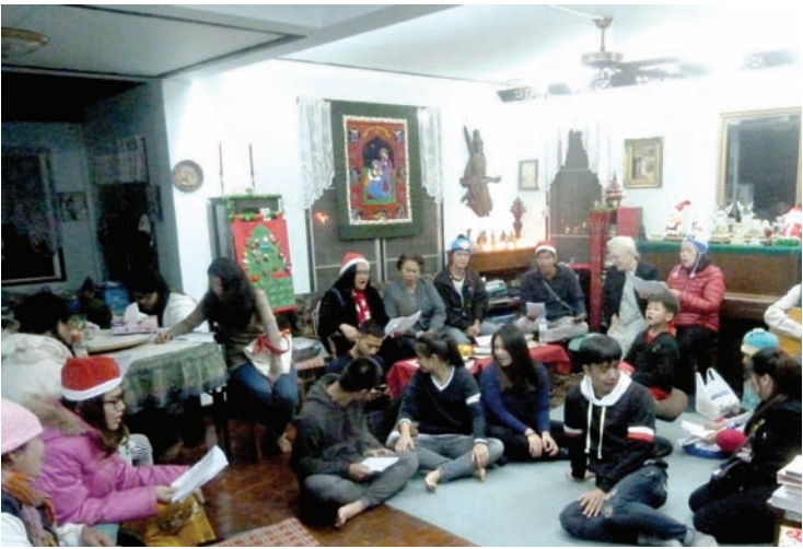
Christmas: We had a wonderful time celebrating Christmas with the Pa-Oh people (left) and in our house with carolers from our Thammanikom Church (right).