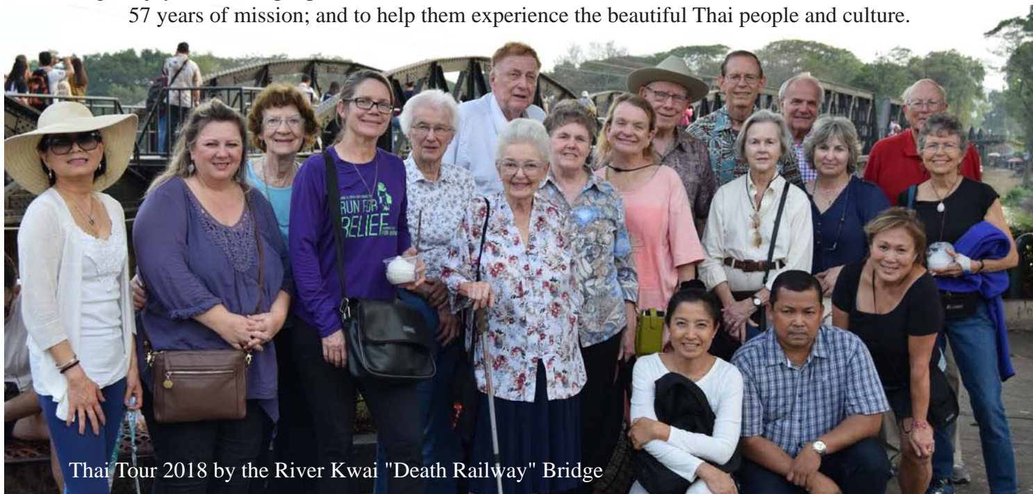
Thai Tour 2018 by the River Kwai "Death Railway" Bridge

It was a great joy to host 15 people on our recent Thai Tour, Jan. 19-29; to share with them some of the fruit of 57 years of mission; and to help them experience the beautiful Thai people and culture.