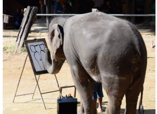
The first day we visited an Elephant Camp where where elephants perform - one painted a self portrait.