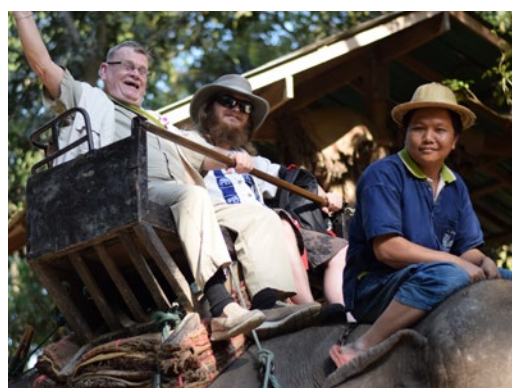
Some of the guests rode elephants like we we used to do when we first came to Thailand.