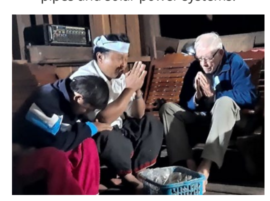
Praying with the headman of the village and his family members.