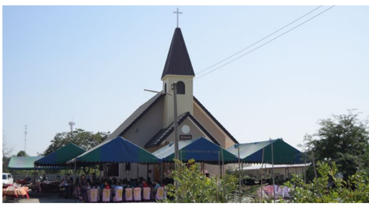
During the trip we joined in the dedication of Sasimum The tour group sang "Angels We Have Heard on High" Church (Lao Song) in Nakorn Pathom.