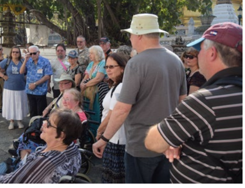
Our tour members tried hard to "adapt to the culture" - but sometimes could not.