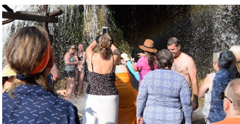
We got to sail, swim and bathe in the Kwai River while at a resort nearby - even under a waterfall.