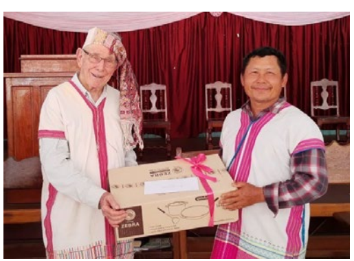
Late Christmas gifts to pastors and evangelists.