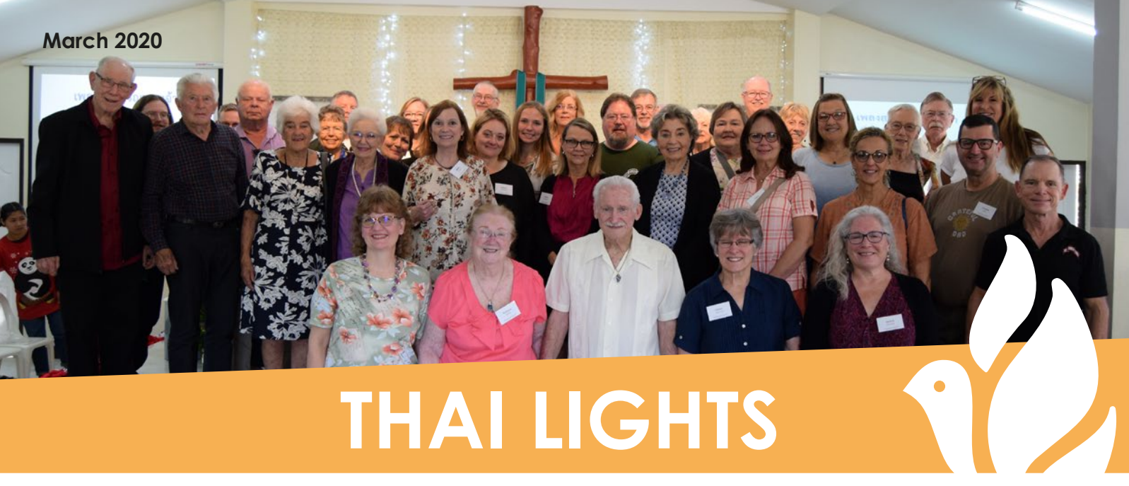
THAI TOUR 2019 From December 6-16, 2019, we were very pleased to host our biggest group yet - 38 guests. It was great joy to show them all around Thailand and introduce them to mission work and Thai culture.