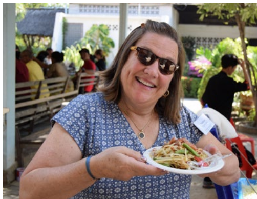
The food during the trip was excellent. One place we even tried to make our own Thai food.