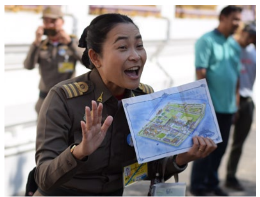
At the Grand Palace in Bangkok, we had an excellent tour guide who patiently explained both the historical and religious significance of the buildings.