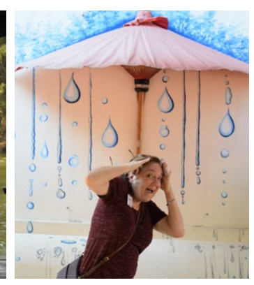
"Glad to have an umbrella!"