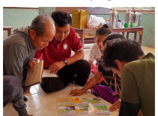
Workshop in Bueng Klueng. Adapting ancient Karen songs for evangelism.