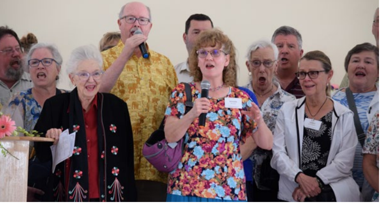
in many of the churches we visited.