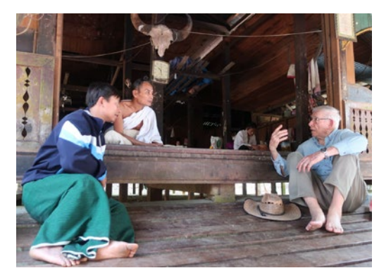
Meeting with the spiritual leader of the Talako.