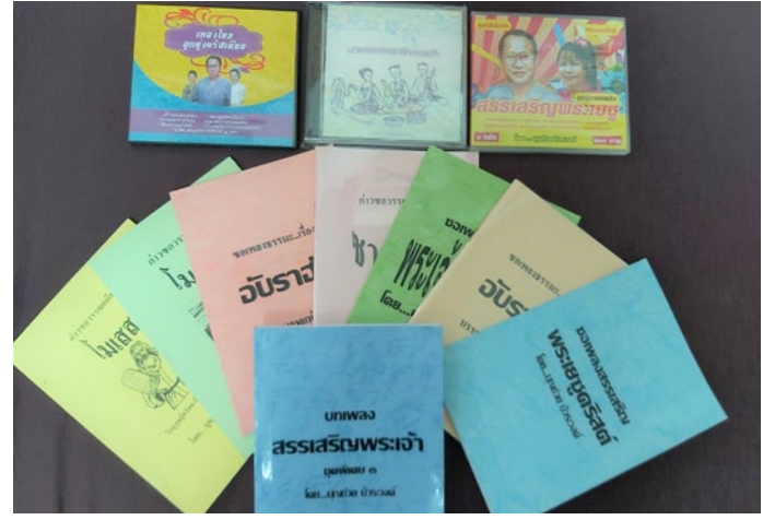
Some of Paw Boonchuay's many works